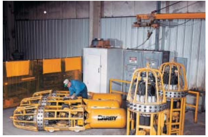
Final inspection before shipping Darby line-up clamps.